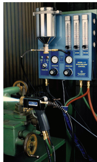
Model J-3 Spraywelder™ System

In the Sprayweld™ Process, a powdered alloy is thermal sprayed onto a part and subsequently fused to the base metal by a heat source. This creates a smooth, nonporous, metallurgically bonded overlay, producing a fused coating within 0.25 mm (0.01”) of the required finished dimension.